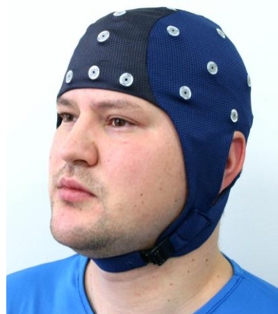
EEG electrode cap