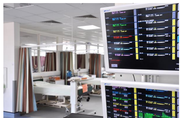
Central monitoring and ECG telemetry on all beds